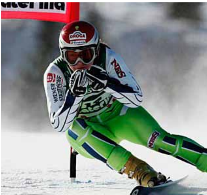
On the photo: Tina Maze.

A total of 133 women skiers from 28 countries, eight of them representing Slovenia, will gather this weekend at Pohorje near Maribor for the 46th running of the Golden Fox meet. The World Cup giant slalom will be held on Saturday to be followed by a slalom race on Sunday.