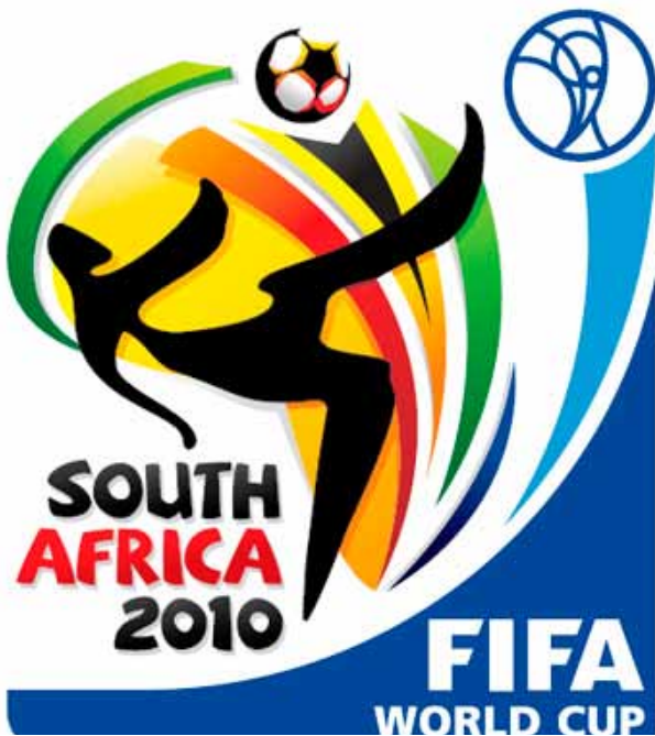
On the photo: World Cup 2010 sign.

Slovenian soccer fans bought around 1,000 tickets for the matches with England and the United States and around 500 for the one with Algeria.