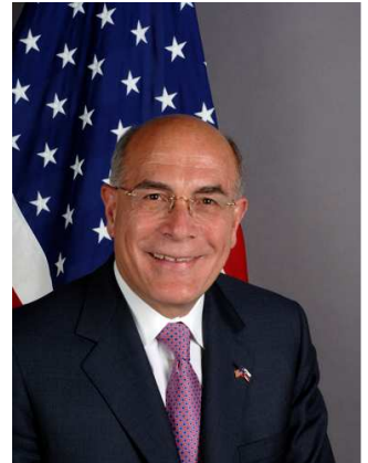
Ambassador Yousif Boutros Ghafari

It is not yet known who will be the new candidate or when the new ambassador can be expected in Ljubljana.