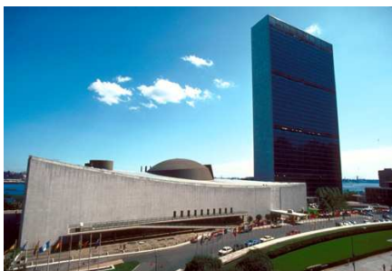
United Nations Headquarters

The ministry explained that as a member of the Advisory Board, Slovenia will be able to put forward recommendations to the UN Secretariat on the operations of the fund and its strategy for promoting democracy.