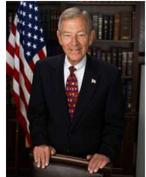
Senator Voinovich of Ohio

Throughout his distinguished career in service to the people of Ohio, U.S. Senator George Voinovich has strived to make government "work harder and smarter and do more with less."