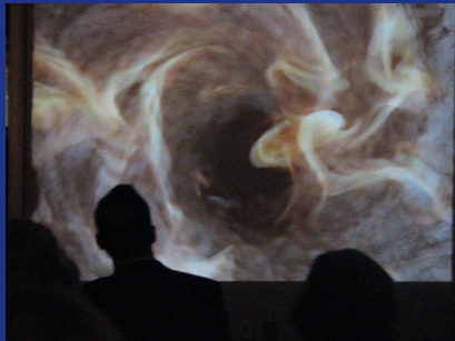
Visitors viewing Prosenc's video art.

December 11- January 30: Transpositions. Video art exhibition 'Transpositions' and mosaic prints 'Vortex' and 'Swimming the Dark' by Nataša Prosenc . Embassy of Slovenia, Washington, DC. For viewing, please call in advance.