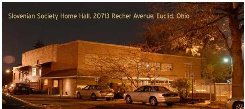
Slovenian Society Home Hall, 20713 Recher Avenue, Euclid, Ohio