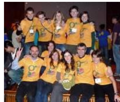
Slovenian students at MIT after winning first prize.

Students from the University of Ljubljana recently came first in the general ranking at the international competition on research projects (iGEM) in the field of synthesis biology at MIT in Boston.